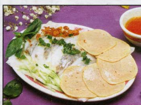
30. Bánh Cuốn Chả Lụa