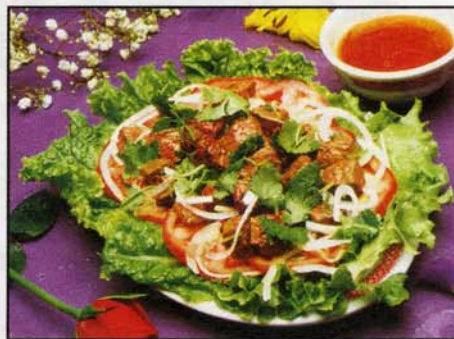
88. Bò Lức Lắc