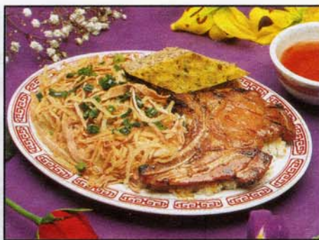
120. Cơm Sườn Bì Chả