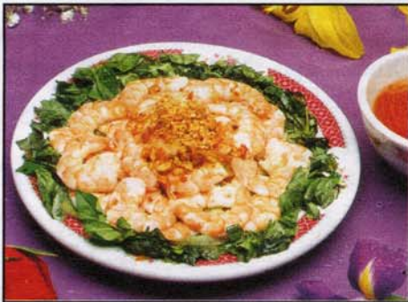
24. Gỏi Tôm