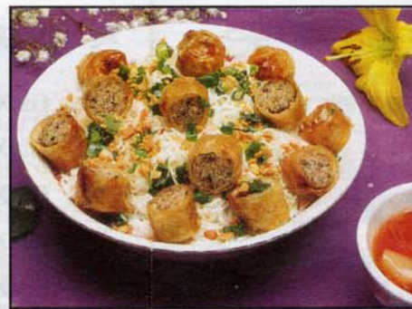
47. Bún Chả Giò