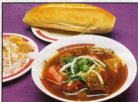
32. Bánh Mì Bò Kho