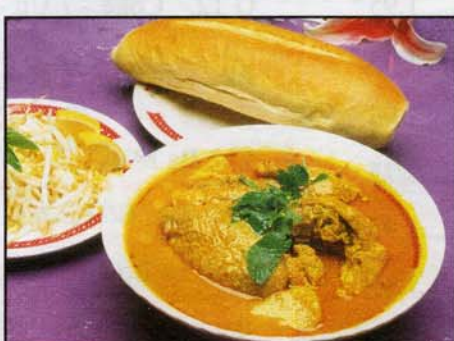
31. Bánh Mì Cà Ri Gà