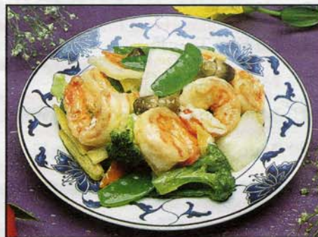
79. Tôm Xào Thập Cẩm