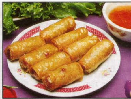
27. Chả Giò