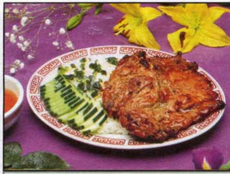
108. Cơm Gà Nướng