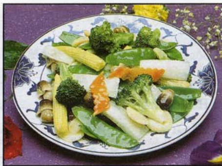
95. Đồ Xào Chay