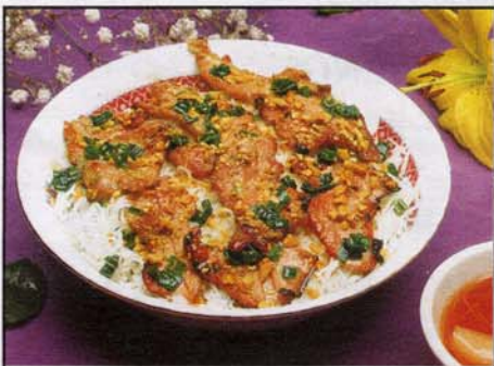
46. Bún Thịt Nướng