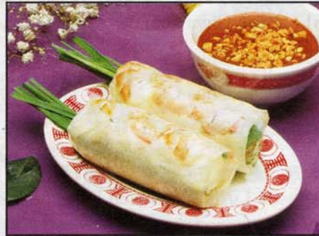
21. Gỏi Cuốn