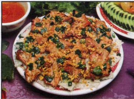
38. Bánh Hủi Thịt Nướng